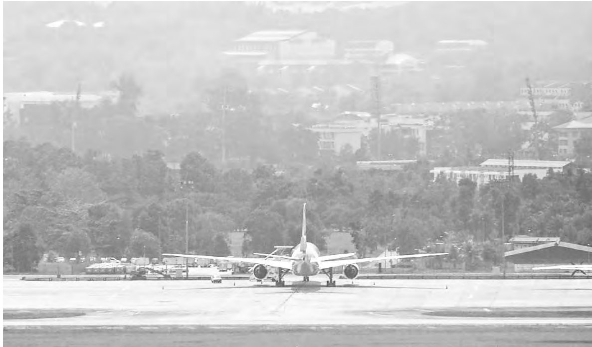
File photo dated September 28, 2011, shows a slight haze condition at the Brunei Darussalam International Airport.

According to an SIIA press statement, the meeting was the first to gather representatives from three affected countries to discuss on ways to stop the worsening haze from blanketing the air every year.